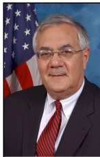
Rep. Barney Frank (D, MA)