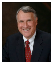
Sen. Jon Kyl (R, AZ)