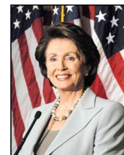
Rep. Nancy Pelosi (D, CA)