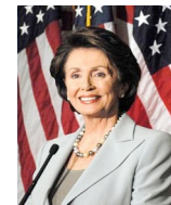
Rep. Nancy Pelosi (D-CA)