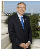
Sen. Harry Reid (D-NV)