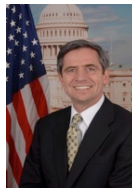
Rep. Joe Sestak (D-PA)